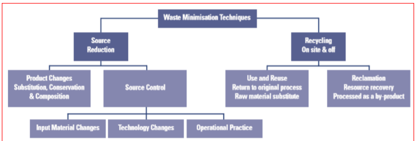
Figure 2: Waste Minimization Techniques

The most successful way to manage waste is not to produce it in the first place and this is the driving force behind the idea of waste minimization.